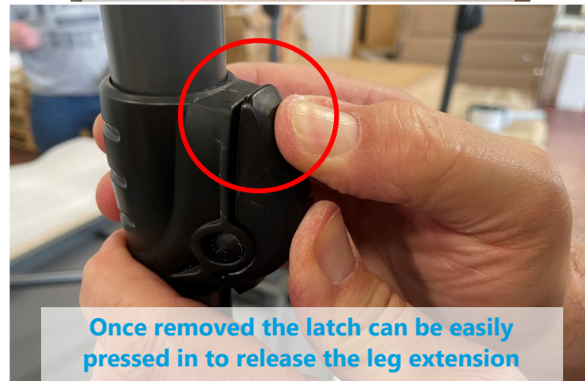
Once removed the latch can be easily pressed in to release the leg extension