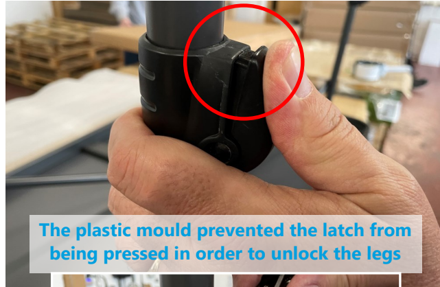
The plastic mould prevented the latch from being pressed in order to unlock the legs

Our team successfully finished the task in a span of four days to ensure that the camping gear was ready for the beginning of the season as per the client's request.